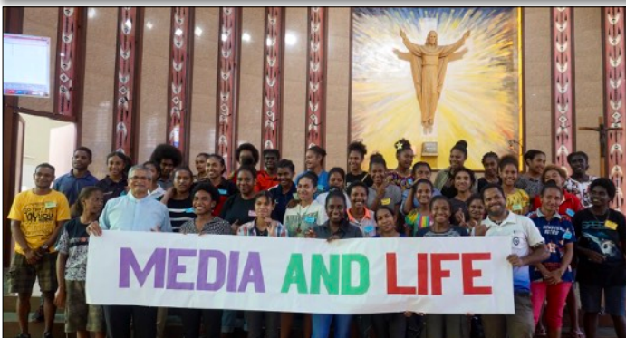
Participants with the animators at the 2nd Life Matters program