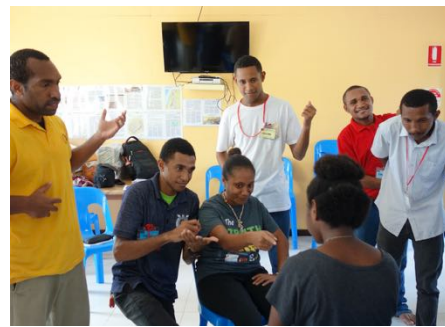
Participants during a session

commenced with interactive games, evening prayer and rosary. The weekend sessions focused on Radio drama and jingles including filming of videos and editing.