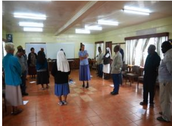
Photographs: Top upper left: Group photo of Diocesan Pastoral Leaders in Goroka Bottom right: Diocesan Pastoral Leaders during their Bibliodrama Training

LCI produces materials and holds conferences and courses in the area of liturgy, faith education and Bible.