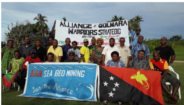
Alliance of Solwara Warriors Strategic Workshop Namatanai

More great news for maritime communities as growth and solidarity takes its progress.