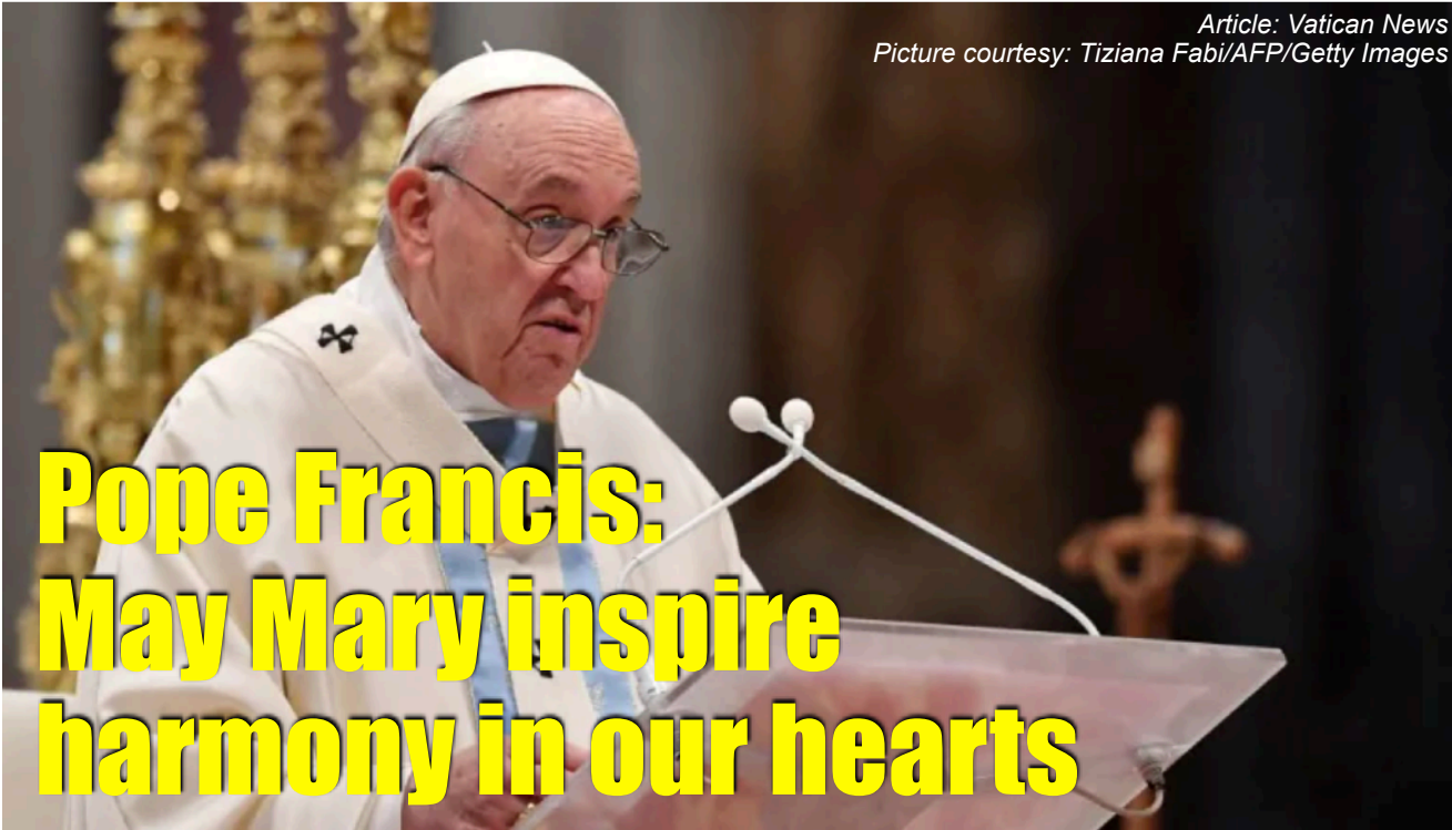
Article: Vatican News