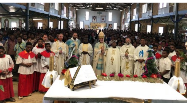
Bp Donald Lippert with participants at the closing of the retreat

Following the Eucharistic celebration, the youths from each diocese preceded to a procession from the cathedral to the Archdiocesan hall where they commenced the closing ceremony with speeches, presentation of gifts and lunch.