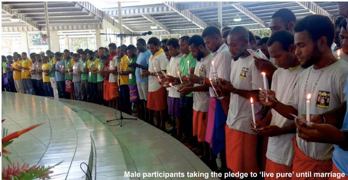
Male participants taking the pledge to 'live pure' until marriage

"I invite you to look to Christ who is the fullness of humanity," the Nuncio stated.