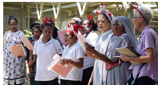
Voluntary Chaplains presenting a Christmas Carol

"The hospital is big, and the Chaplains are few! But, with the strong backing of many