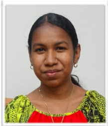
- Abigail Seta

In his Homily on 1 st January 2020, Pope Francis reflected on the significance of women, overall, in numerous ways, saying that women are givers and mediators of peace and should be fully included in the decision-making processes.