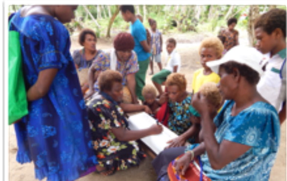
Kinavai sea parade