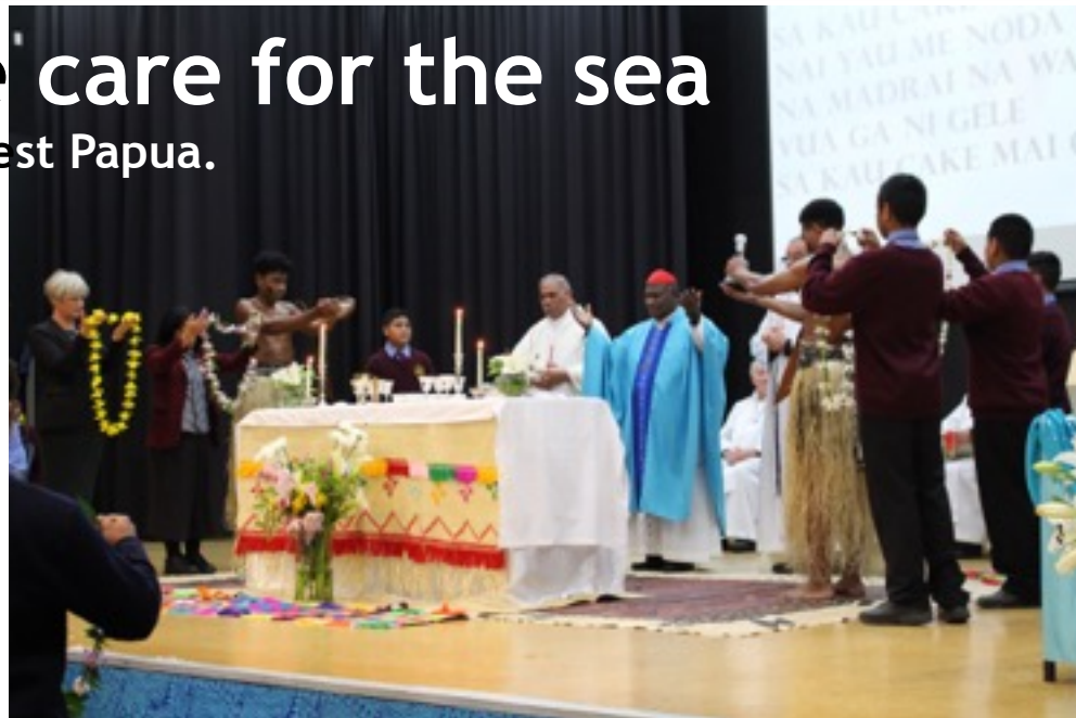
Cardinal John Ribat MSC, presider at the concelebration

A further focus has been the livelihood and cultural integrity of the people of West Papua. We do not promote a view in regard to independence. Indeed we believe that where this question becomes