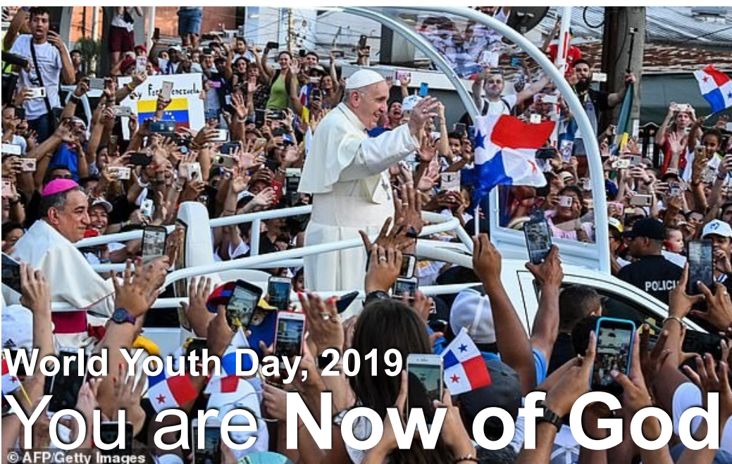
World Youth Day, 2019 You are Now of God