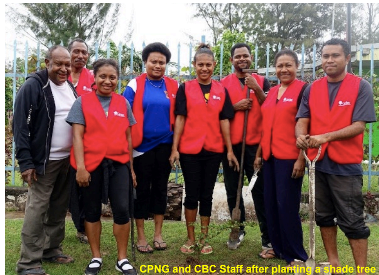
CPNG and CBC Staff after planting a shade tree

The CPNG team were joined by the Catholic Bishops Conference of Papua New Guinea and Solomon Islands (CBCPNSI) where they planted