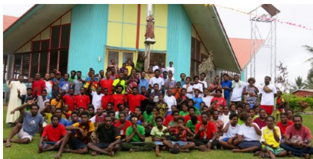
Youths from the Diocese at the Youth Convention

Daru: Nearly 200 Catholic Youth from Southern part of the Diocese of Daru – Kiunga attended the youth convention held from 23 rd to 27 th September in Daru.