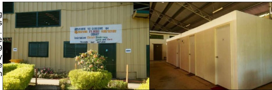
YC Hall that is now used as a quarantine facility in the Diocese of Bougainville.

The period leading from March to May saw the Diocese delivering awareness to the people through the parish priests in all the parishes. Holy Week and Easter celebrations were celebrated with emphasis on family taking the lead with adherence to liturgical instructions put in place by the Catholic Bishops Conference of Papua New Guinea and Solomon Islands.