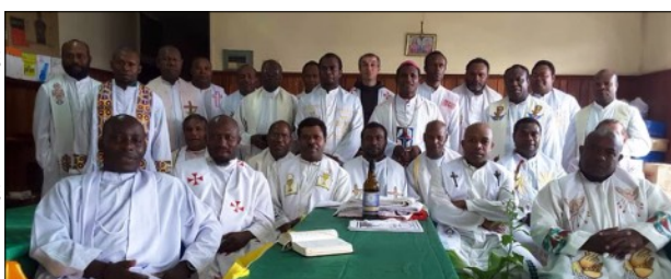
Priests from Diocese of Kimbe at the senate conference.