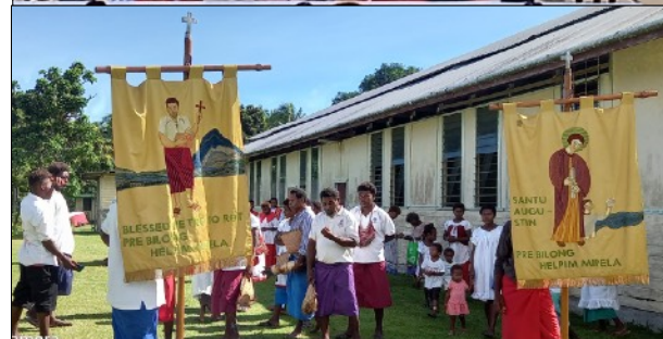
memorable beatification of Blessed Peter ToRot in 1995.