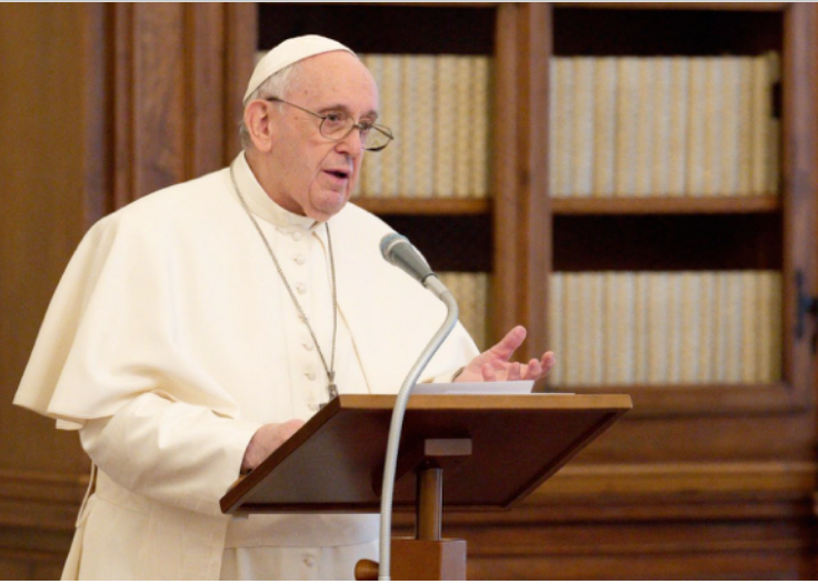
Pope Francis addressing the people from the Apostolic Palace

"May the Virgin Mary, who always kept Jesus' words and gestures in her heart, and followed Him with total willingness and faithfulness," he concluded, "help us to listen to Him and follow Him, to experience the signs of His salvation in our life."