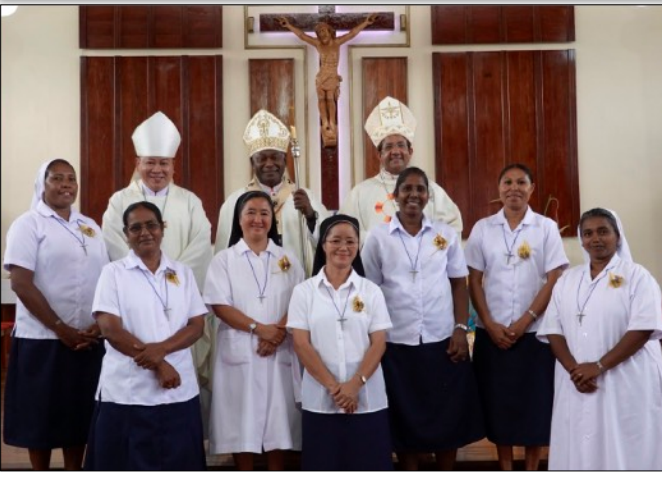
Apostolic Nuncio, Cardinal Ribat, Bp Pedro and the Cluny Sisters

Boroko, Port Moresby: The Catholic congregation of the Sisters of St Joseph of Cluny (SJC) marked 50 years of faithful service in Papua New Guinea with a thanksgiving mass on Saturday, 23 rd January.