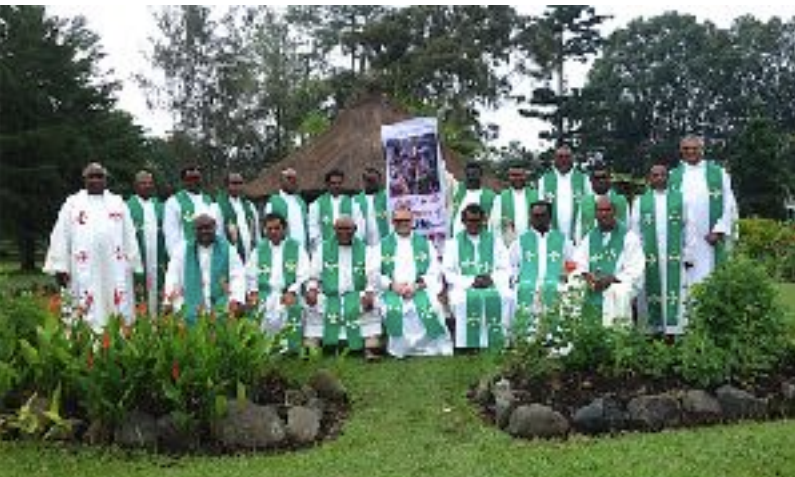
The participating priests of the Vangeke Institute Program

Commencing on the 27 th of September and concluding on the 7 th of November, 2018, it had taken as its theme: “Priest - Called to the fullness of Life and Love” in line with the Year of Youth.