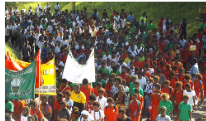
Youth from the Archdiocese of Rabaul at the convention