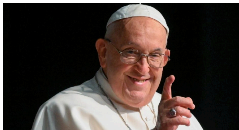
The Holy Father greeting the crowd

"Let us turn to her in spiritual union with the faithful gathered at the Shrine of Pompeii," he incited, "for the traditional Supplication to Our Lady of the Holy Rosary."