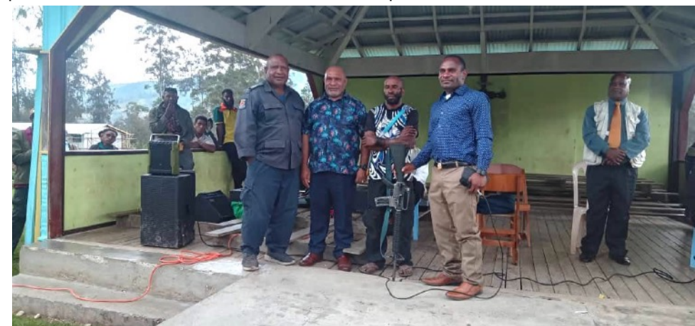
Key stakeholders in a group picture with the surrendered M16 rifle...

This event is one of the many successes of the Peace Advocacy campaign being carried out in Enga Province by Caritas Enga. All tribes and individuals in possession of firearms are challenged to surrender these deadly weapons so that peace can be restored and maintained in the province.