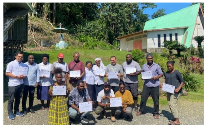
Participants of the workshop with CBC SOCOM Personnel pose for a group picture after the closing ceremony.

"I can now bring HOME, back to my home Sidea". "Few of the things which I have come to learn apart from radio broadcasting sessions. H which stands for humility; the second one being O for openness; third being M for Meraki, Greek term that means to doing something with passion and love; and the fourth one being E, is of course, Evangelization".