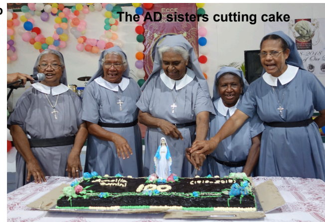
The AD sisters cutting cake