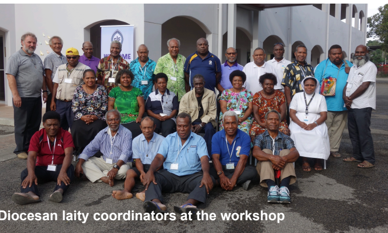
Diocesan laity coordinators at the workshop

Olsem na pasin bilong stap holi na santu i kamap ples klia taim yumi olgeta yet i strongim ol gutpela pasin long ai bilong God. Yumi ken tok tu olsem yumi yet ino gat laip. Laip yumi stap laip long em bilong God olsem na yumi mas larim laip bilong God i kamap ples klia long laip na wokabaut bilong yumi. Yumi ken prei na pasim tingting wantaim olsem bai olgeta tingting na wok yumi laik mekim long laip bilong yumi i mas oltaim sut stret bihainim wei na pasin bilong God Papa, God Pikinini na God Holi Spirit husat i origin na pinis bilong olgeta laip na wokabaut yumi gat long dispela graun.