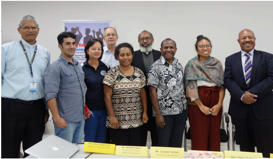
Guest speakers at the panel discussion

Question and Answer session between the audience and the panellists