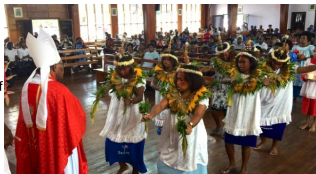
Offertory Procession led by ladies from Duke of York Islands

He was killed for refusing to cease carrying out his duty as a catechist in leading his people in praying, instructing the children in the faith, witnessing and blessing marriages and above all defying the order of the Japanese allowing polygamy by defending the sanctity of Marriage. He was officially declared by Pope St John Paul II a Martyr for the faith during the Beatification Ceremony at Sir John Guise Stadium, Port Moresby on 17 th January 1995.