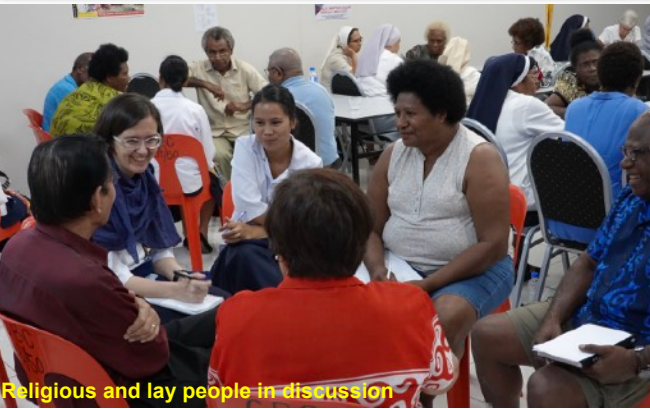
Religious and lay people in discussion

Port Moresby: What are the challenges facing the Catholic Church at this time? What are the solutions?