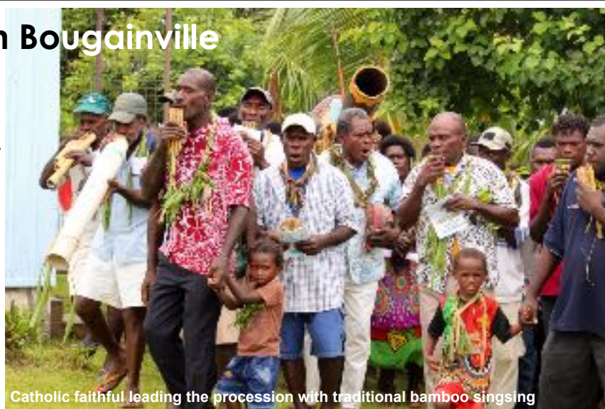
Catholic faithful leading the procession with traditional bamboo singsing

in the face of many political challenges of today. At the beginning of the liturgy of Mass that marked the anniversary Bp. Rochus blessed water during the penitential rite which then was sprinkled on the people. This same blessed water is to be taken out to the people in the communities and parishes used during the reconciliation services. Bp. Rochus reflected on the political challenges in Bougainville and said that "the role of Church during the referendum and after is fostering peace and reconciling people of different clans, beliefs and political opinions". The Vicar General of the Diocese of Bougainville, Fr. Polycarp confirmed the outlined role of the Church and said that, the Church will help the people of Bougainville during the processes leading to the Referendum and beyond by through reconciliation services. Apart from the celebrations, the Diocese launched its first radio station, DOB FM 103.1. The launch was aimed at presenting, for the first time,