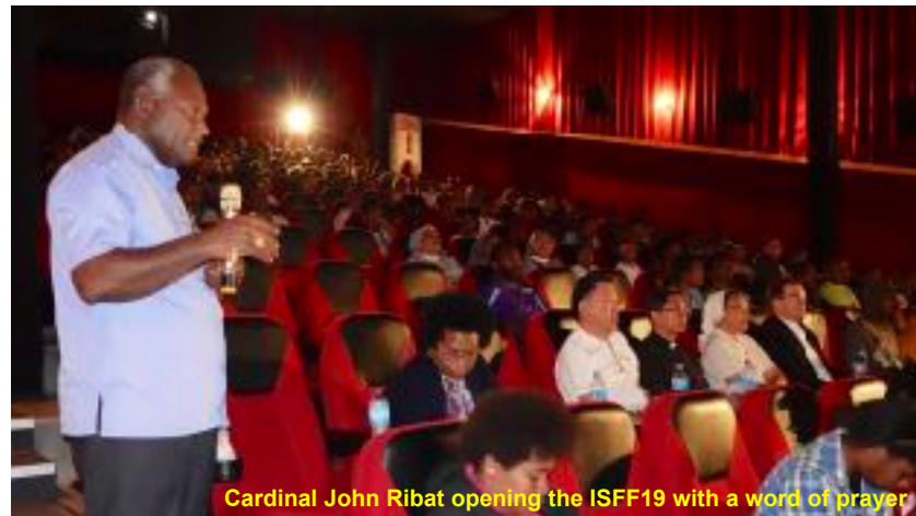
Cardinal John Ribat opening the ISFF19 with a word of prayer

Participating in the festival were students from Caritas Technical Secondary School, De La Salle