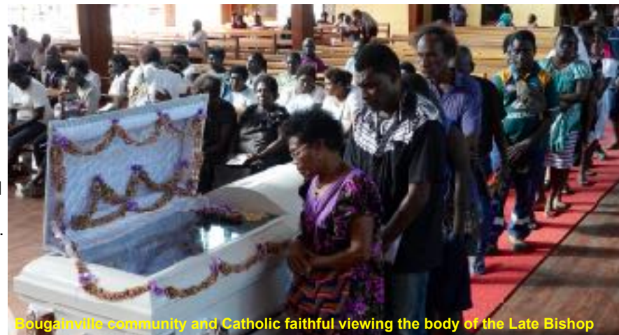
Bougainville community and Catholic faithful viewing the body of the Late Bishop

Entered Eternal Life: Saturday 10 th August 2019