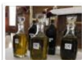
Chrism Mass, Mendi