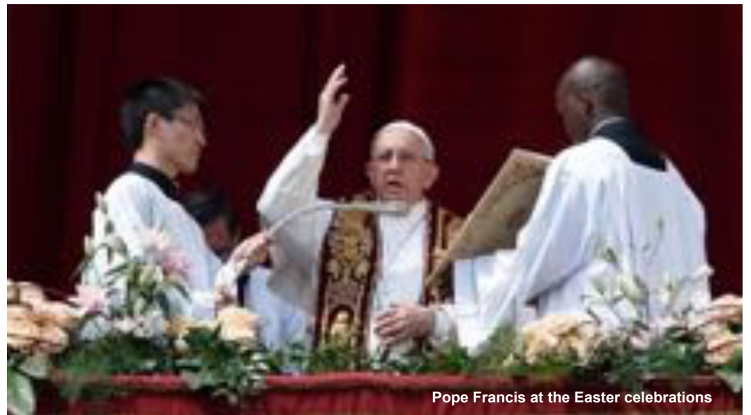
Pope Francis at the Easter celebrations

And this isn't a fantasy; the Resurrection of Christ is not a feast with many flowers. This is beautiful, but it isn't this, it's more; it is the mystery of the discarded stone that ends up being the foundation of our existence. It means Christ is risen. In this disposable culture where what