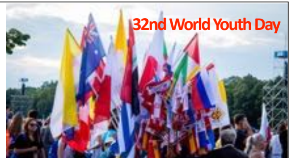
32nd World Youth Day