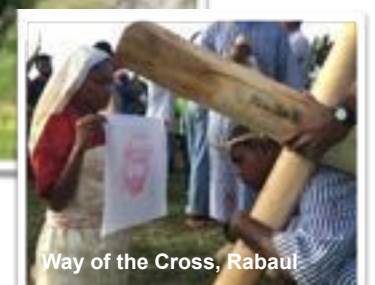
Way of the Cross, Rabaul