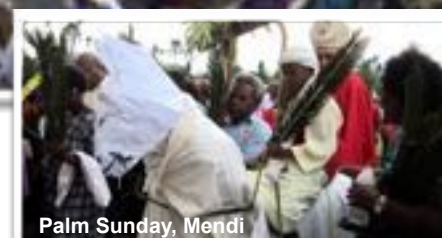
Palm Sunday, Mendi