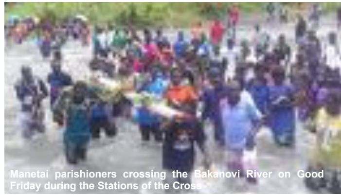
Manetai parishioners crossing the Bakanovi River on Good Friday during the Stations of the Cross

Buka: The Catholic faithful from Saint Xavier Manetai parish, central deanery in the diocese of Bougainville observed the Holy Week and Easter Triduum with prayer, meditation and reflection on the Passion, Death and Resurrection of Christ. Over the years, it has become a tradition for parishes and institutions in Bougainville to use creativity in their meditation on the Passion of Christ. This year saw more than 1000 parishioners from Manetai mostly from the upper lands flocking to the mission station along the eastern coast of Bougainville to meditate on the passion of Christ.