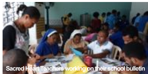
Sacred Heart Teachers working on their school bulletin

The Spirit helps us draw inspiration from the Good News amid the dramatic events of our time, and opens new paths of confidence and hope. May we have the courage to share our stories of HOPE.