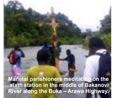
Manetai parishioners meditating on the sixth station in the middle of Bakanovi River along the Buka – Arawa Highway.