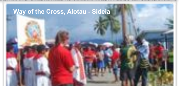
Way of the Cross, Alotau - Sideia