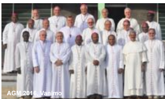
AGM 2016, Vanimo

A fund raising dinner will be held at Dynasty, Vision City in aid of the proposed new office complex will be held on the 29 th April. Friends and well-wishers are welcome to participate in the same.