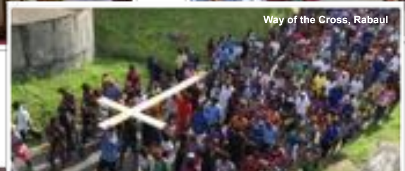
Way of the Cross, Rabaul