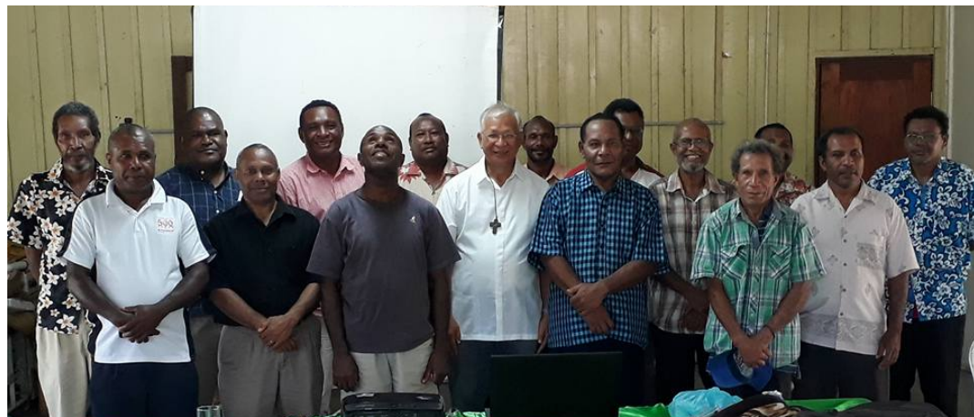
Left: Milne Bay Churches Coalition at their meeting on 14th September

We should boldly protect our seas and the whole of our environment for the future.