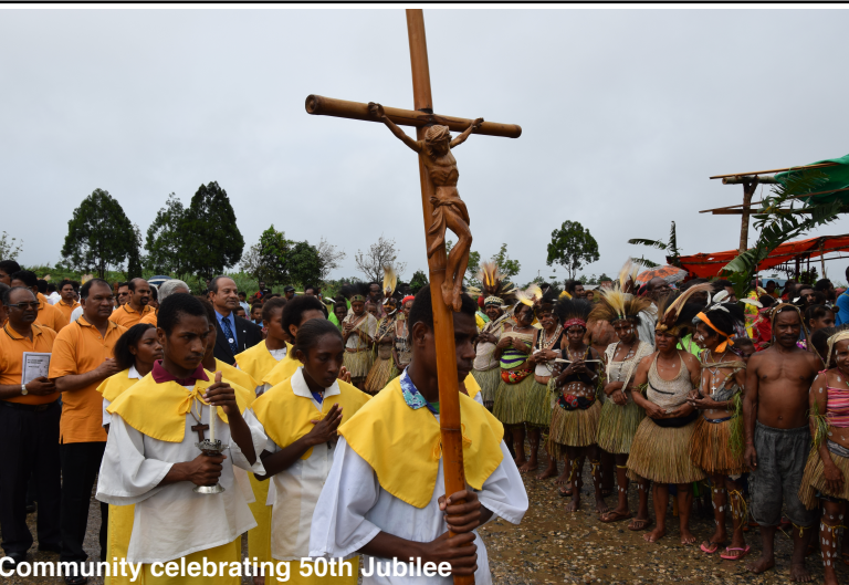
Community celebrating 50th Jubilee

The Montfort Brothers of St. Gabriel colourfully celebrated their 50 th Golden Jubilee in Kiunga, Western Province from September 22nd to 23rd, 2018.