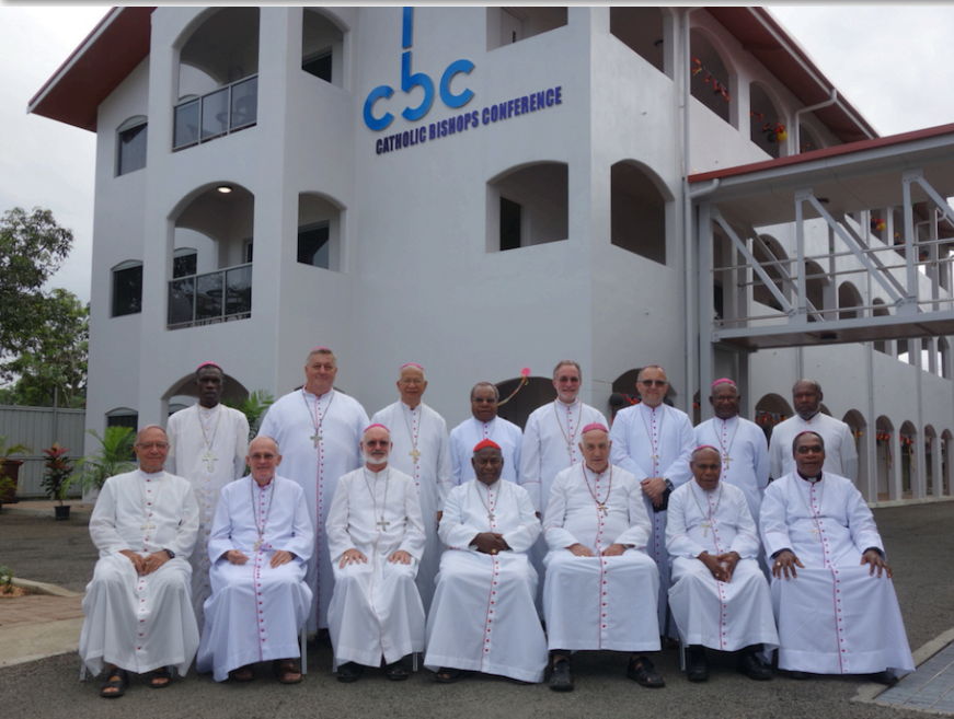
CBC Bishops at the AGM and Workshop in September